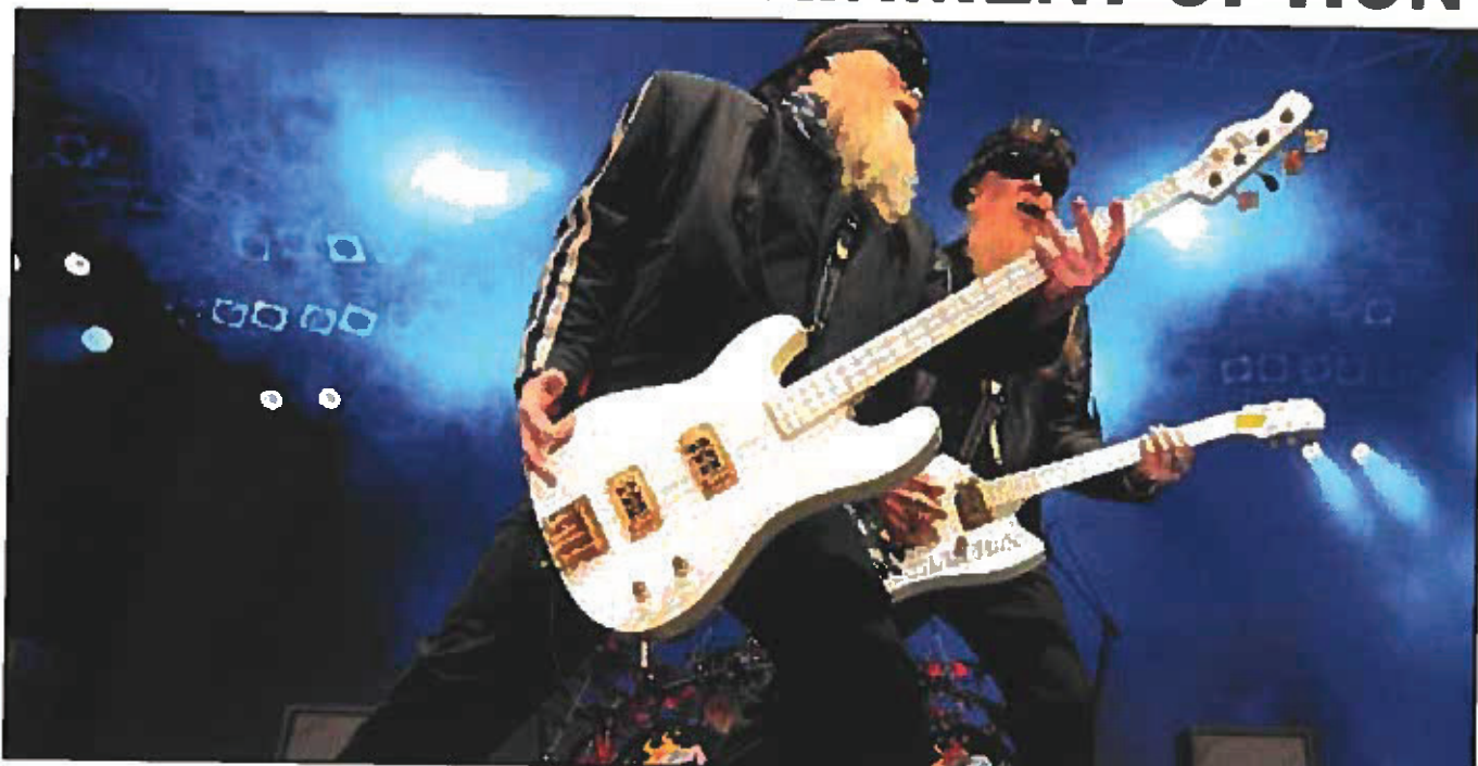
ZZ Top, one of the scheduled Innsbrook bands, preforms in concert