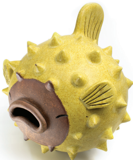
DAISY DUDLEY | “PUFFER PLANT” | CERAMIC