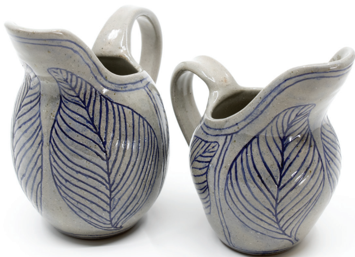
YULIN DUDLEY | CERAMIC