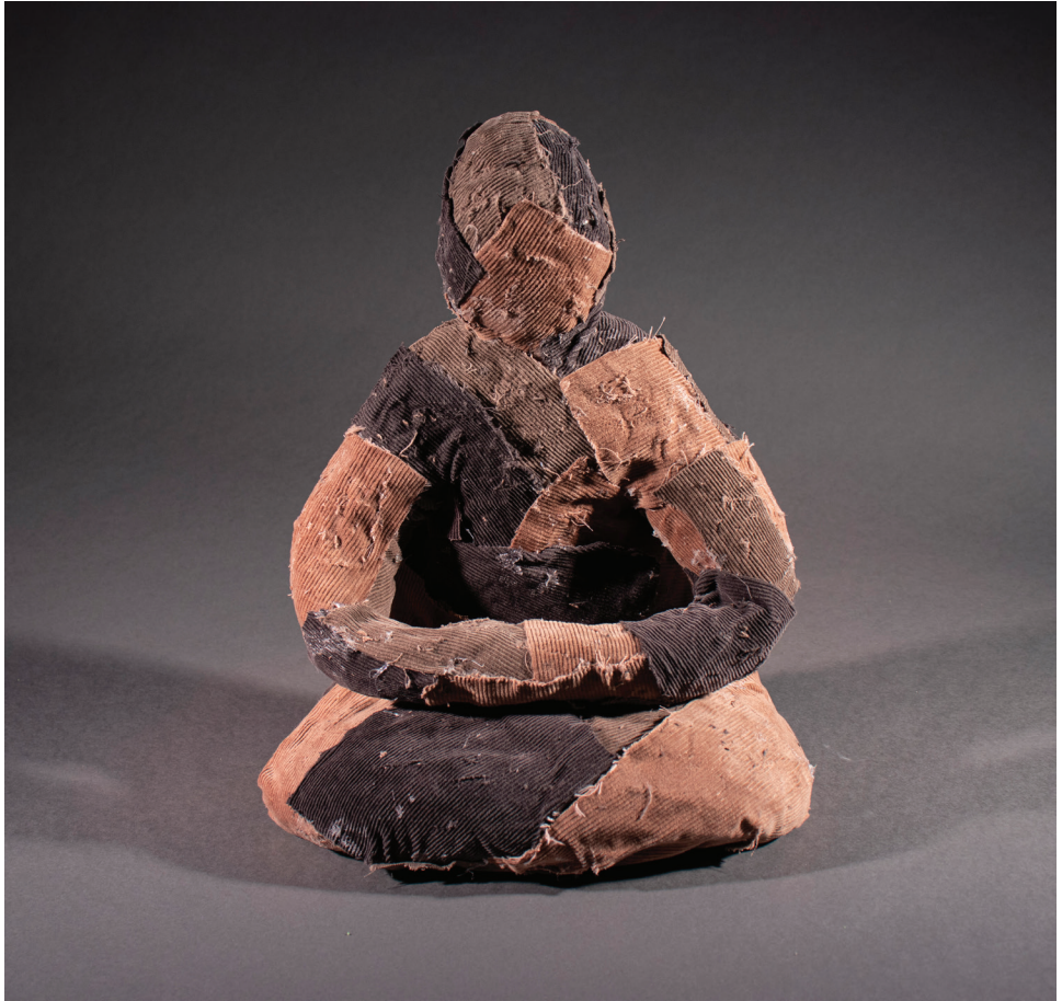
LUCA SUN | " CORDUROY BUDDHA " | MIXED MEDIA