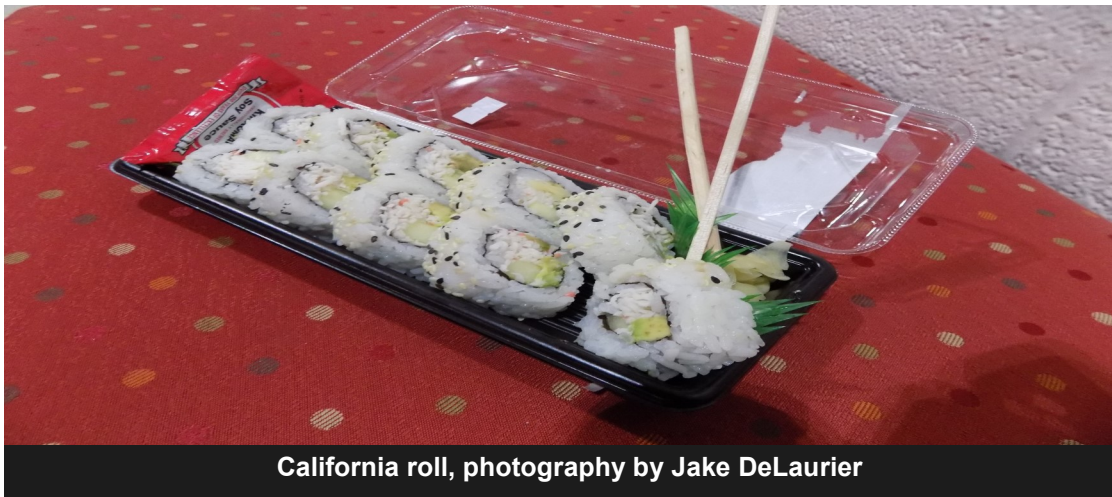
California roll

Overall, the new sushi items are a great addition to Littlejohn's and are perfect for students seeking an alternative to sandwiches.