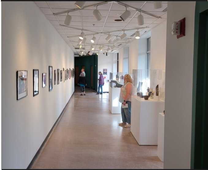
North Hall Gallery.