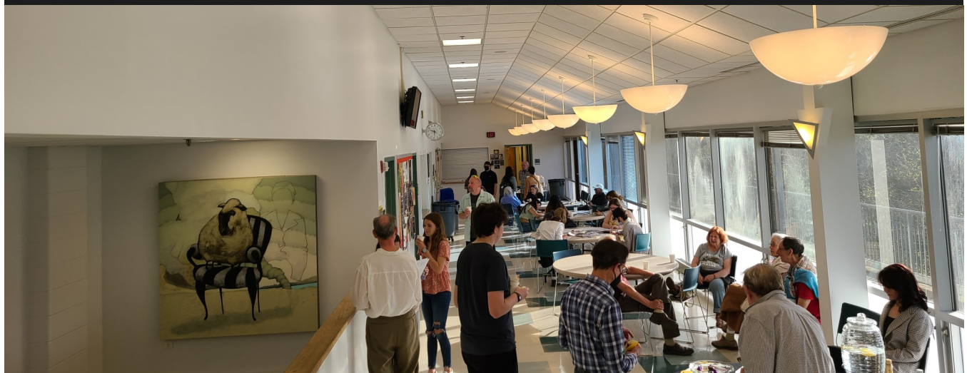
Attendees gather to eat chocolate and chat.