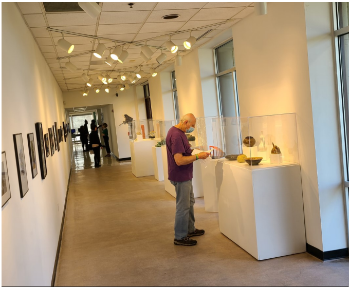
South Hall Gallery.